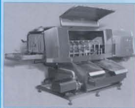
Washing machine WR 350.60 H