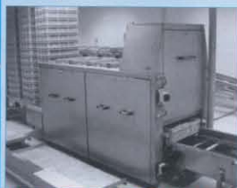
Multiple de-stacker type DCS-M