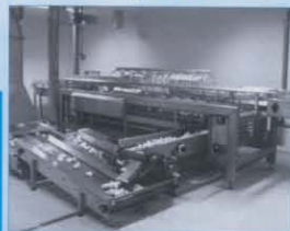
Separator type 5120