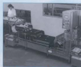
Chick counter type CC-6-60S