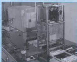
Candling unit type CU-60